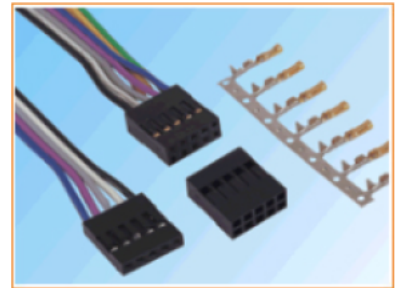
Twin Cable , this end is ok